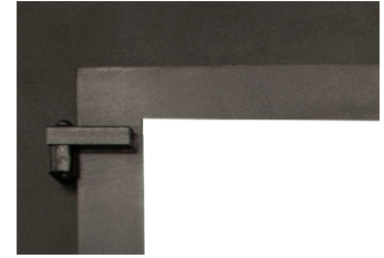
Single Piece Laser Cut Frame