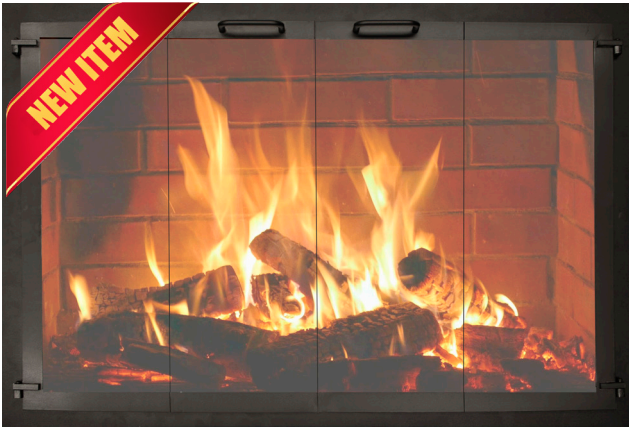
Shown in Textured Black