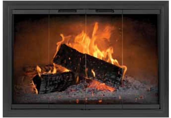
Shown in Grey Iron.