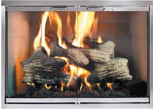
Shown in Stainless.