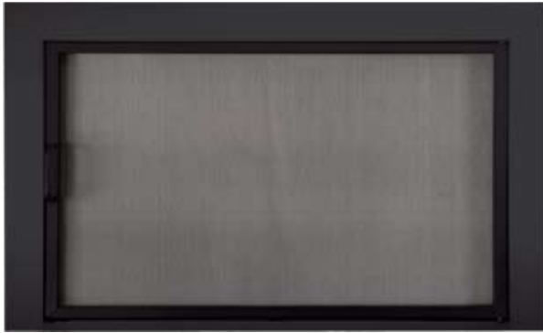
Reserve model shown in Black.

FINISH OPTIONS – Gold Antique Vein, Silver Antique Vein, Copper, Pewter, Natural Iron, Black Iron, Grey Iron, Bronze Iron, Old Iron, Moss Iron